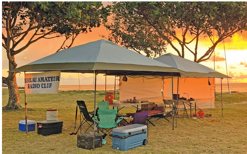
A sunrise over the Koolau Amateur Radio Club, KH6J, 2022 Field Day 1A station, at Kualoa Regional Park in Oahu, Hawaii.

Class C — Mobile or rover operators from vehicles, bicycles, and even boats: 58 entries (1.2%).