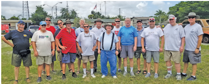
The crew at the Platinum Coast Amateur Radio Society, W4MLB, in Melbourne, Florida, entered the 2022 Field Day in the 4A category.

In January 2022, ARRL commissioned a survey about the event, which was sent via email to individuals and clubs who submitted entries for the 2020 and 2021 Field Days. Based on a consensus derived from the more than 3,000 survey responses, the Field Day rules were updated to include: limiting the highest power level to 100 W (removing the up-to-legal-limit 1 x power multiplier), allowing Class D (home) stations to continue to earn points for contacts made with other Class D stations, continuing club aggregate scoring in future events (i.e., the scores of individual stations are combined under the score of a single club), and revising our media publicity criteria to require that publicity be obtained (not just attempted), where any combination of bona fide media hits would qualify for the bonus points. Some publicity examples that would meet the bonus criteria include posting the details of your upcoming or ongoing Field Day activity or results on a club or news media site, or a social media platform; photos and videos are encouraged.