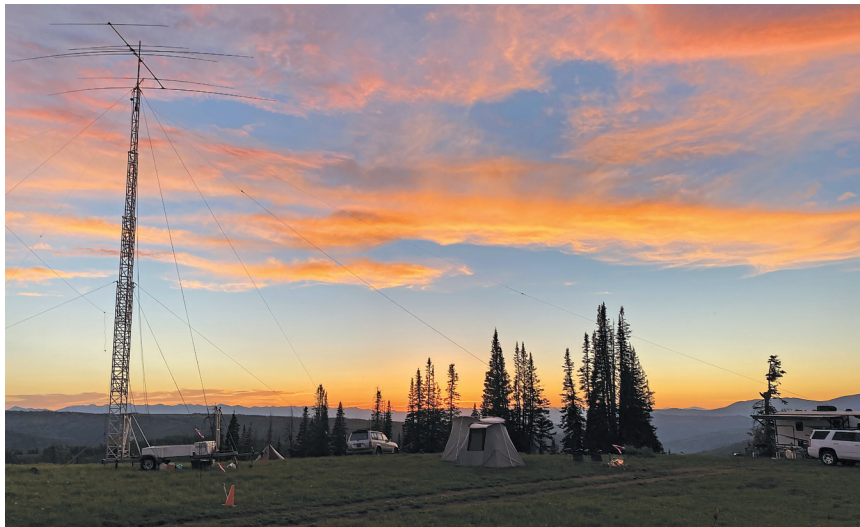
The Saturday-night sunset over Gary Penley's, K7KA, 3A Field Day site at the Uinta National Forest in Utah.

The 2023 ARRL Field Day will take place on June 24 – 25.